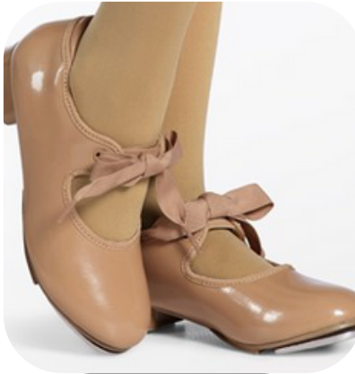
Ages 4-2nd Grade Tap

PURCHASE THROUGH THE STUDIO WEISSMAN NO-TIE FULL-SOLE BALLET SHOES