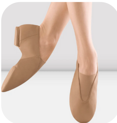
Grades k-12th Jazz/Pom & Kick

AVAILABLE THROUGH THE STUDIO CAPEZIO HANAMI SPLIT SOLE CANVAS BALLET SHOES IN PINK