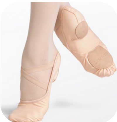
Grades K-12th Ballet

AVAILABLE THROUGH THE STUDIO CAPEZIO CADENCE TAP SHOES IN THE COLOR BLACK