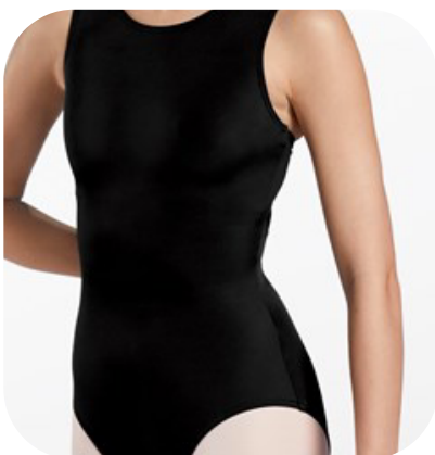
9th/12th Grade Ballet

REQUIRED STUDIO LEOTARD PINK TIGHTS REQUIRED BALLET SHOES