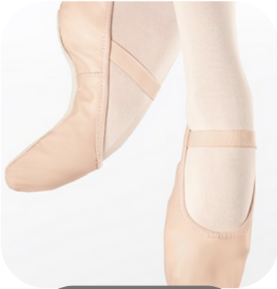
Ages 3 & 4 Ballet

PURCHASE THROUGH THE STUDIO WEISSMAN NO-TIE FULL-SOLE BALLET SHOES