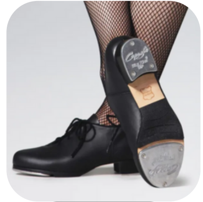
Grades 3rd-12th Tap

PURCHASE THROUGH THE STUDIO WEISSMAN RIBBONETTE TAP SHOES